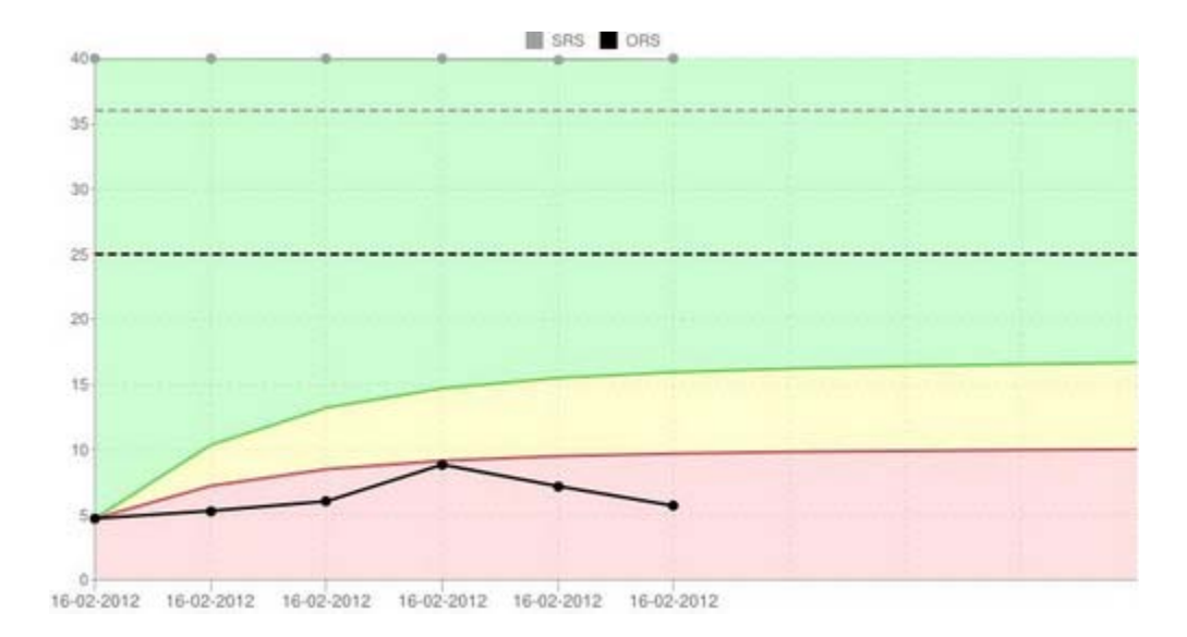
Figure 1: The green area represents successful outcomes; the red area represents unsuccessful outcomes. The solid black line represents the actual ORS score, plotted session by session from left to right

Detailed descriptions of these applications can be found online at: <u>http://scottdmiller.com/performance-</u><u>metrics/</u>.